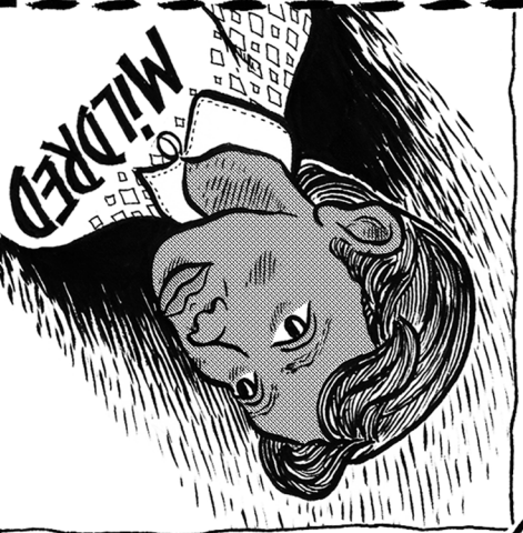
illustration & design by IVAN KLIPSTEIN 2017